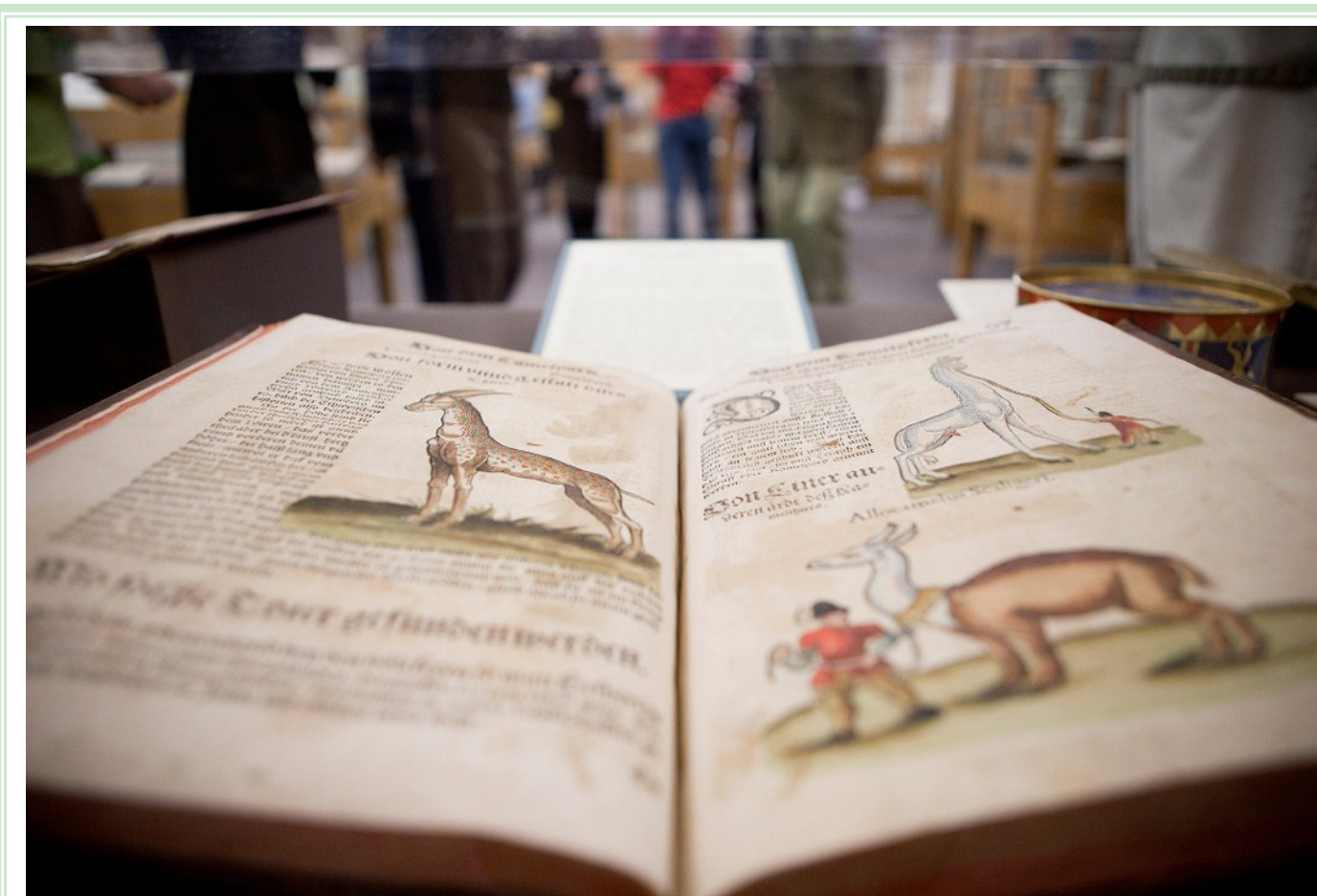
Exhibit in Kroch Library