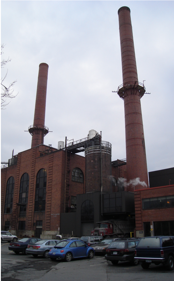
Combined Central Heating and Power Plant