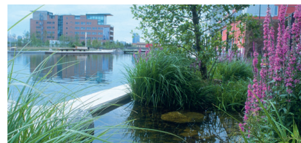
Examples of stormwater management incorporated into landscape design